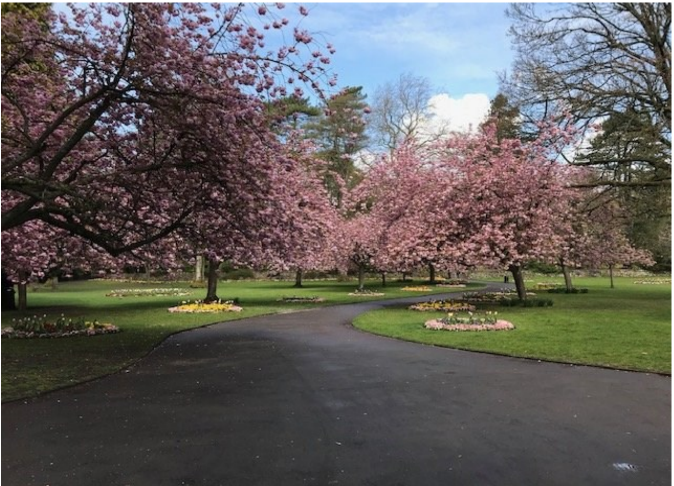
Cherry Blossom in Town Gardens